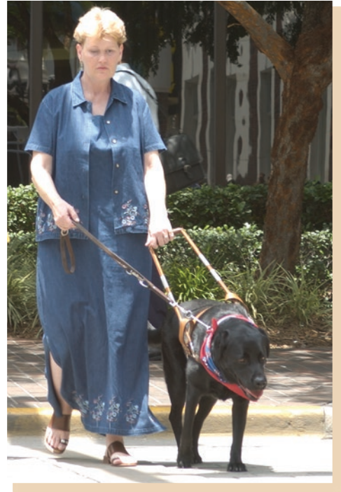
A helper dog at work

A helper dog has a lot to learn. It has to learn the difference between a red light and a green light. It has to learn how to act on a bus and with other animals. It must learn to obey its owner.