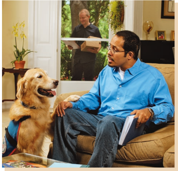
A helper dog and its owner are partners.

At last, a trained dog and its new owner meet. They learn how to live as partners. The dog helps its owner. The owner cares for the dog.