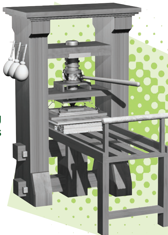
a printing press

Governor Cosby had Zenger put in jail! He said that the stories in Zenger's newspaper told lies. He claimed that the lies hurt him. Zenger stayed in jail for ten months before he even had a trial.